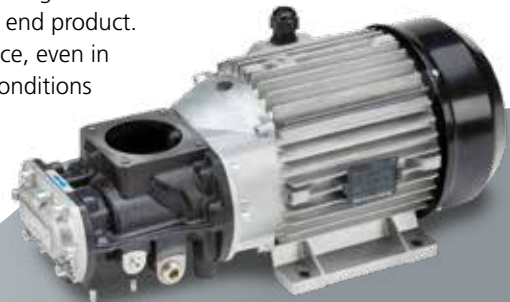
FS 26TFC with highly efficient operation

PLUG&PLAY CUBE is ready for use: it is supplied already equipped with RotarECOFLUID mineral oil.