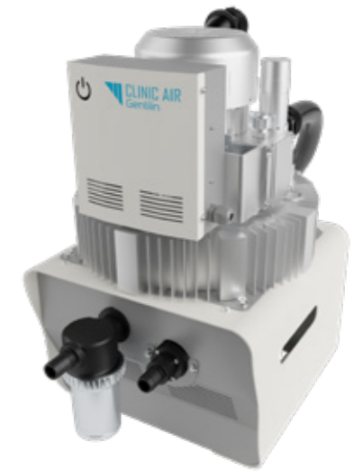
▼ Clinic SW3