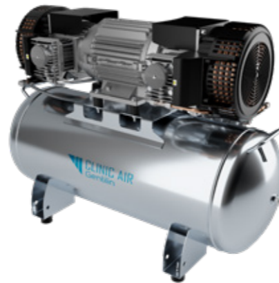
▼ Clinic 6.90