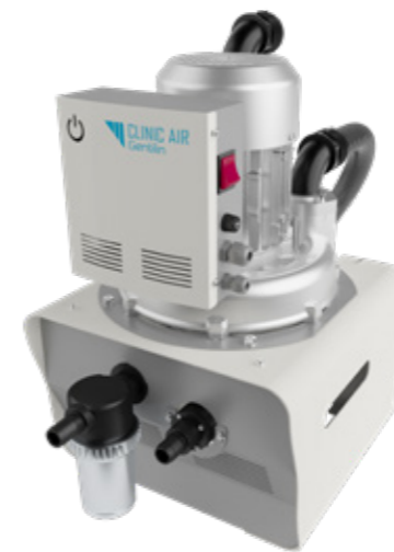
▼ Clinic SW1