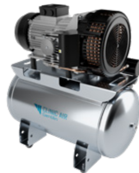
▼ Clinic 3.40