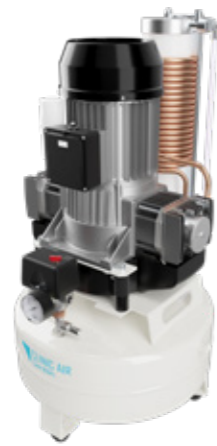
▼ Clinic 3.24