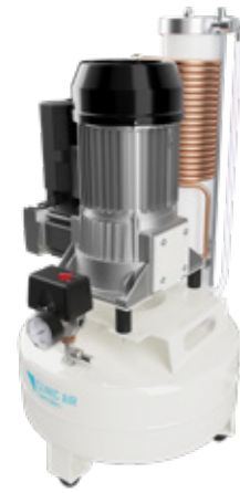
▼ Clinic 1.24